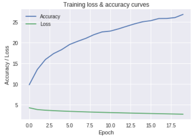
Fig. 1. Training loss and the accuracy curves of the NN class training

This time the result is a little better than the before: now the accuracy of the network on the test set is of 30% (it goes from 28% to 30%). I can say that this result is quite normal because of the CNN is a neural network using convolution layer and pooling layer. These two kind of layer improves the solutions: