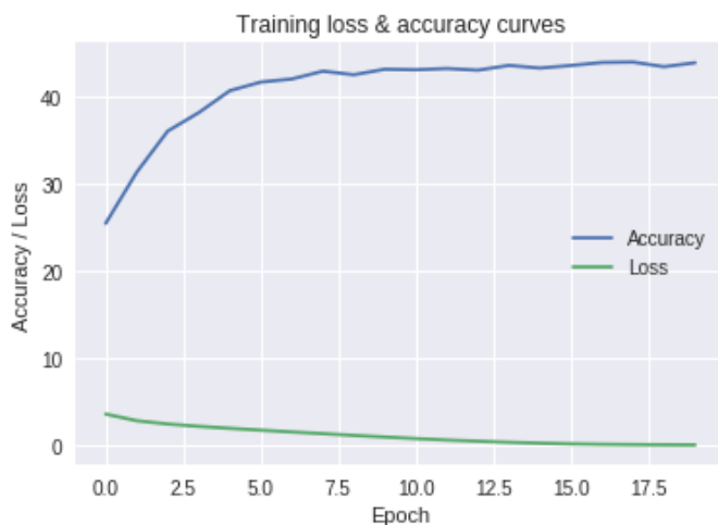
Fig. 2. Training loss and the accuracy curves of the CNN class training

Fig. 2 shows how change, at each epoch, the accuracy and the loss of the current network on the test set. It's clearly visible the overfittig: from the 8th to the last epoch the loss decrease but the accuracy still not change.